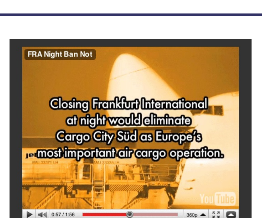
Click & Share

"We are convinced that under these difficult circumstances, we can offer you the best possible connections to the 300 destinations we globally serve," Michael concludes.